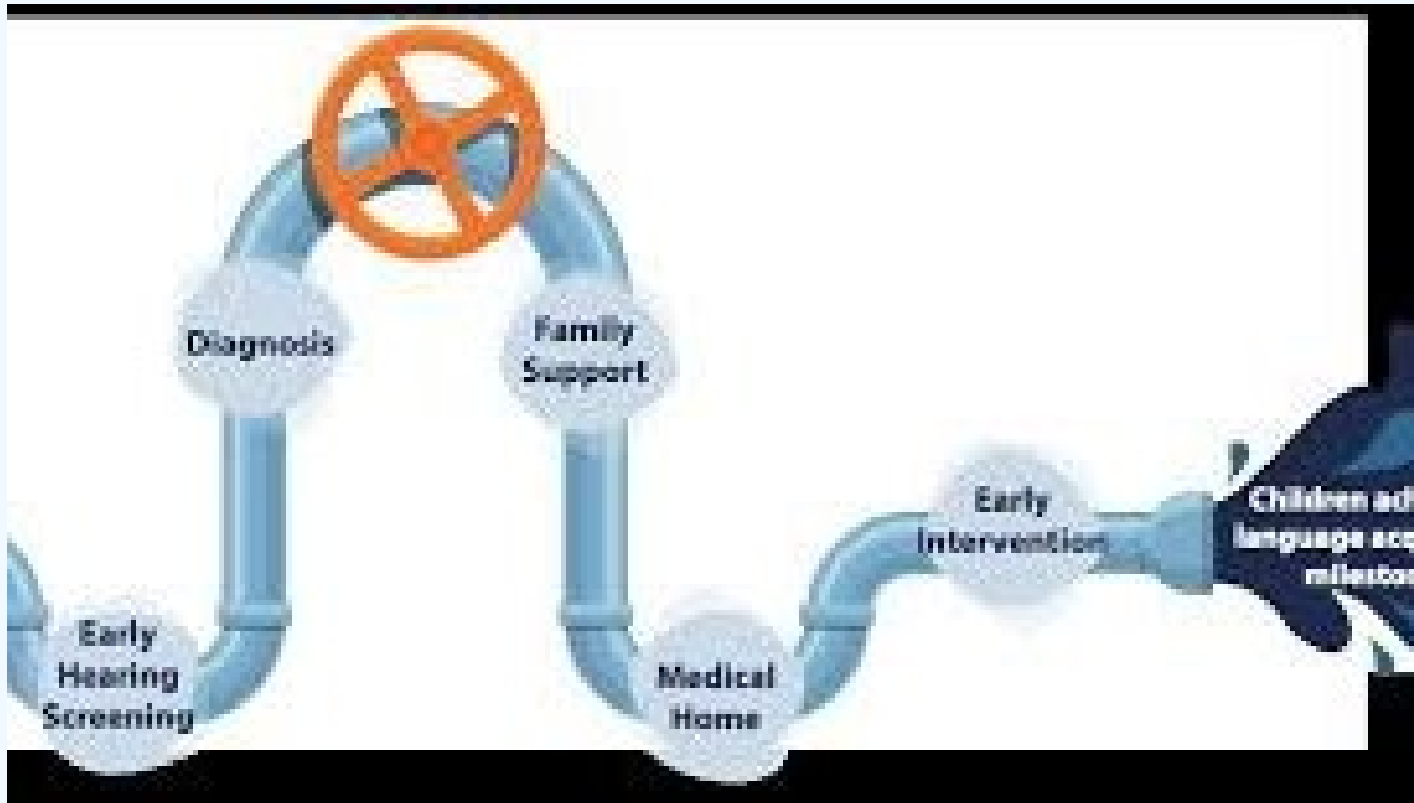
"From Screening to Success: A Hopeful Pathway"